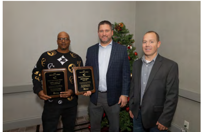
L: U # # U o " #

Project: US-12 (Michigan Avenue) west of Belleville Road to Haggerty, Wayne Co. Contractor: Cadillac Asphalt LLC, Rawsonville Plant Owner: MDOT Metro Region, Taylor TSC